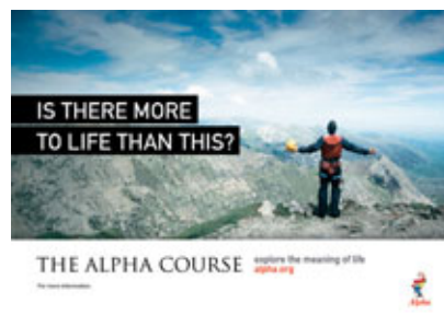
Poster A1 Landscape 594mm x 841mm $35